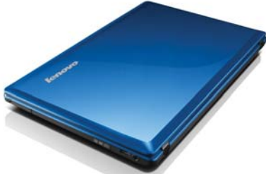
Lenovo G480/G580 Blue (Glossy)